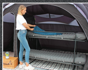
CAMPING BUNK MATTRESS