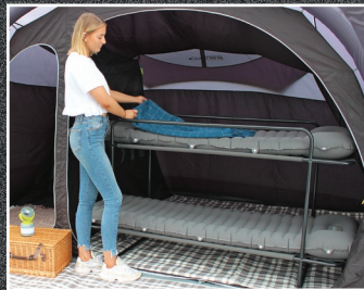
CAMPING BUNK MATTRESS