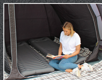
SINGLE OR TWIN BY CLIPPING TWO MATTRESSES TOGETHER