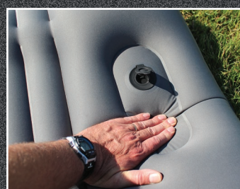
INTERNAL MANUAL PUMP INFLATION SYSTEM