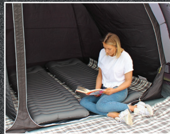
SINGLE OR TWIN BY CLIPPING TWO MATTRESSES TOGETHER