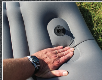
INTERNAL MANUAL PUMP INFLATION SYSTEM