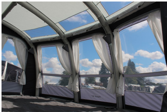
ESPRIT 420 PRO