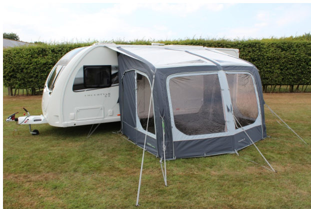
ECLIPSE 325 /325L /325XL PRO